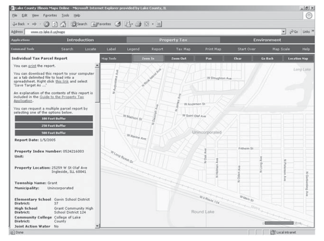
Exploring tax parcel information